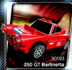
30193 250 GT Berlinetta