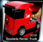
30191 Scuderia Ferrari Truck