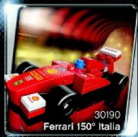
30190 Ferrari 150° Italia