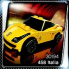
30194 458 Italia