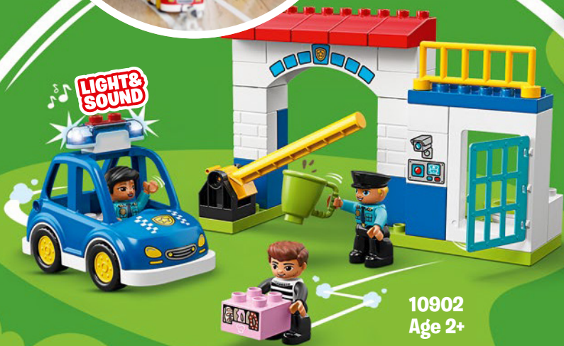
10902 Age 2+