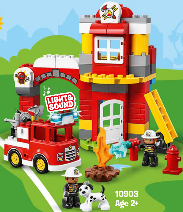
10903 Age 2+

Light and Sound Licht und Geräusche Son et lumière Luz e suoni Luz y sonidos Luz e Som Fény és hang Gaisma un skana 灯光和声音